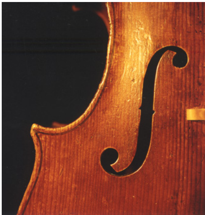
F-hole detail of a Domenico Montagnana cello