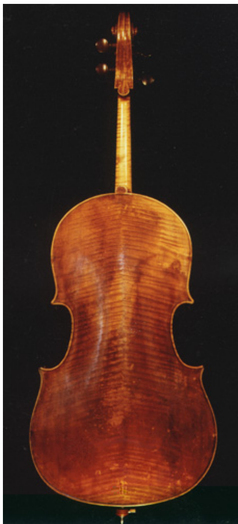
Back of a Domenico Montagnana cello 1735