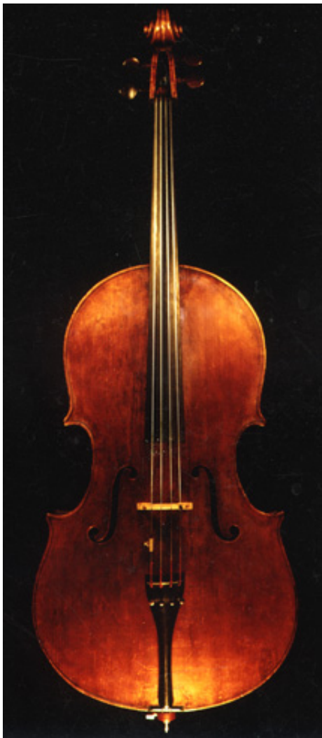
A Domenico Montagnana belly 1735

Our Montagnana model corresponds to the instrument that Boris Pergamentshikoff (built in 1735) played - a very voluminous instrument.