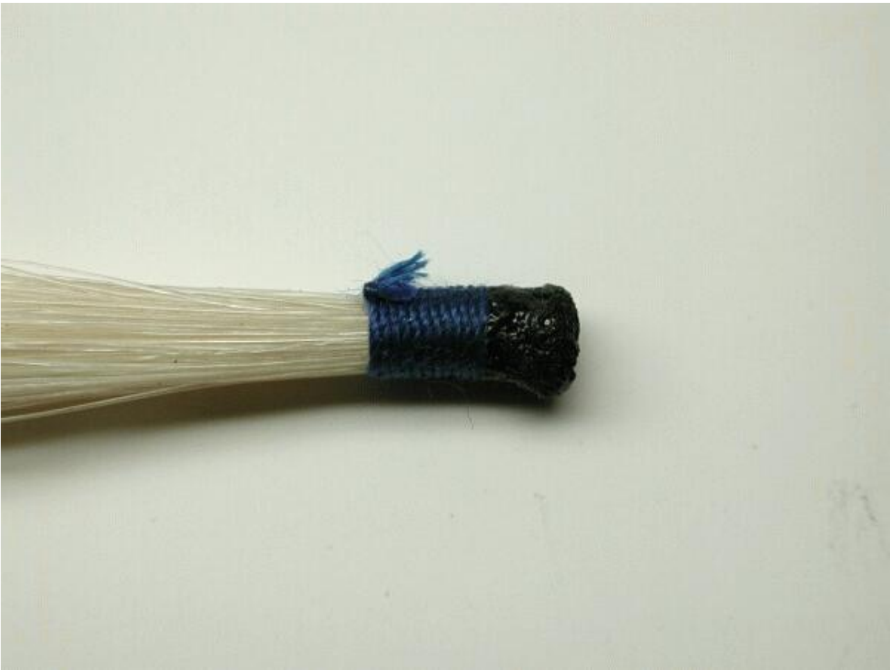
Tied bow hairs (from Mongolian white stallions) that have been singed with rosin.