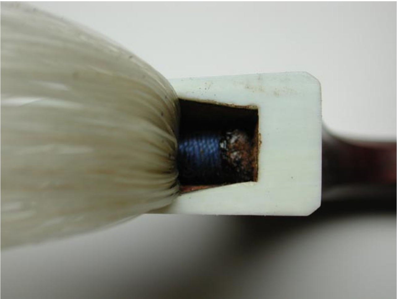
Hairs are shown in the mortise at the head of the bow.