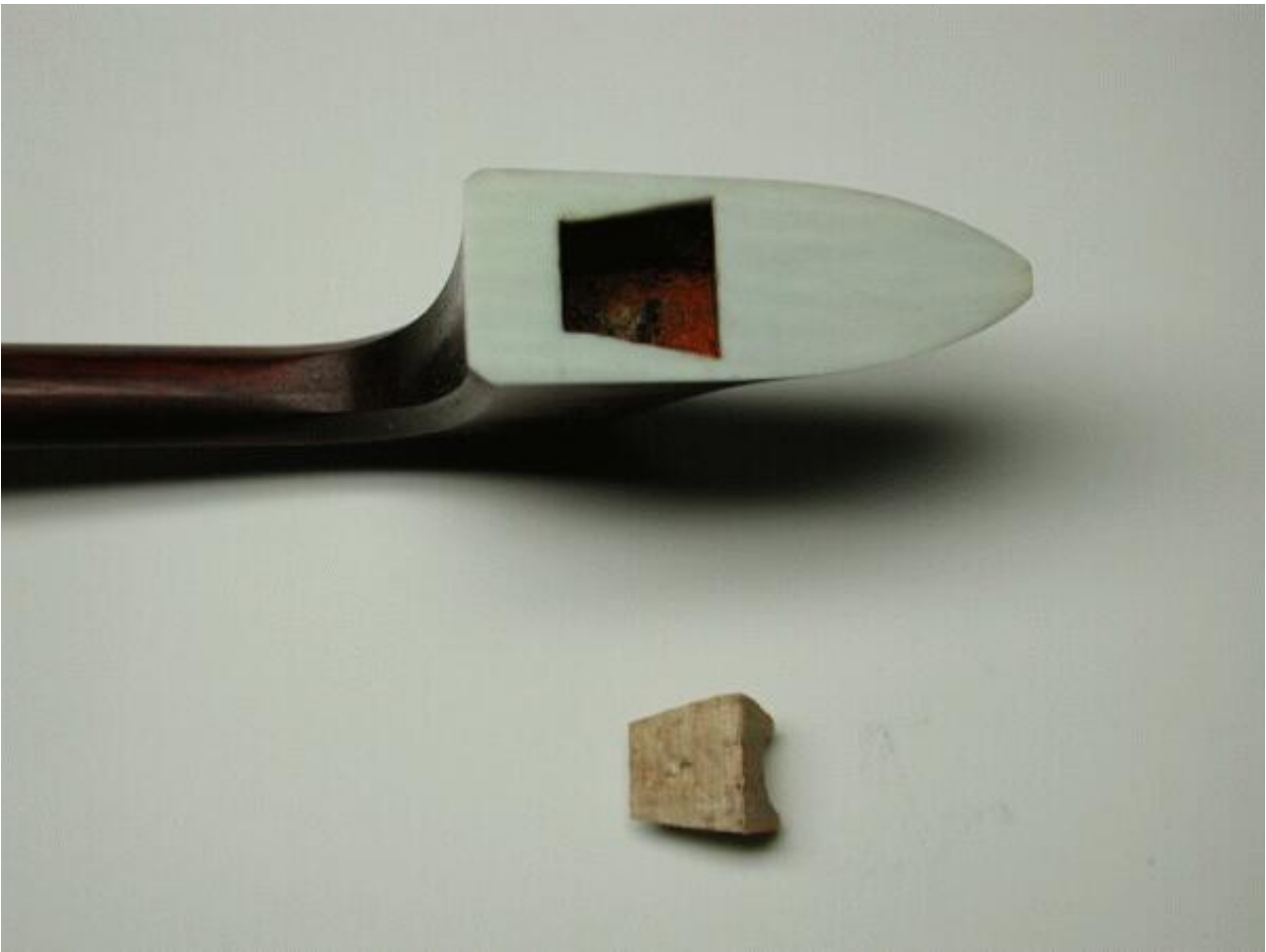
Corresponding bows head and the head wedge.